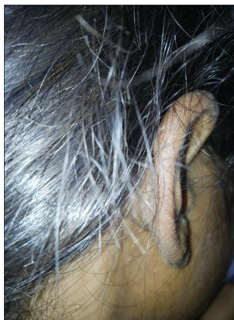
Fig 4: 1 ST Follow up

Definitive treatment of ear lobe keloid has always been a surgical challenge. High incidence of the recurrence is generally associated with the surgical excision.