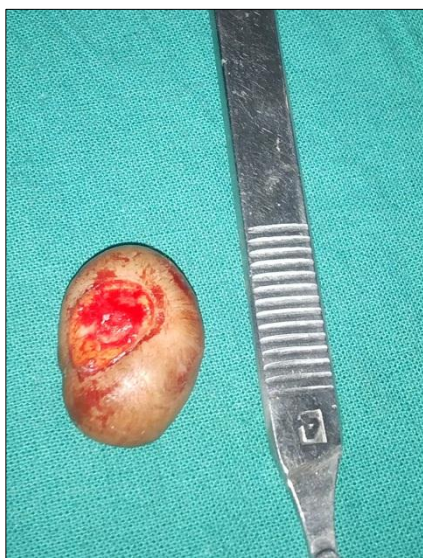
Fig 2: Excised Keloid Tissue

Subcuticular suturing was done to avoid suture marks. Excised tissue (Figure – 2) was sent for histopathological examination.